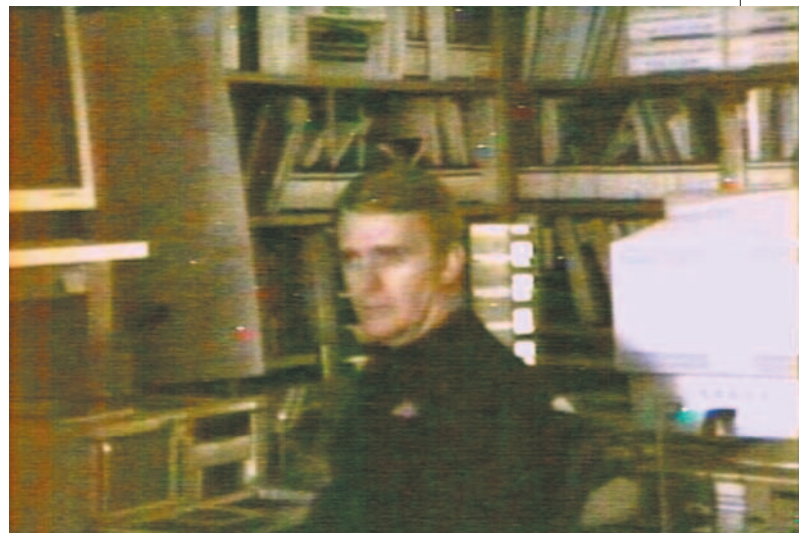
The Video Analyst™ System has the ability to stabilize, register, and zoom selected frame areas. This unprecedented method improves dark surveillance video with dramatic effect.