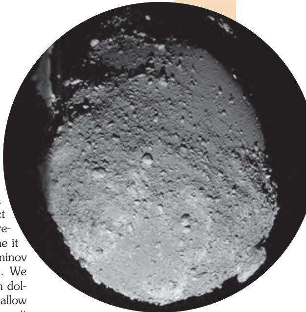
The boulder-studded surface of Itokawa, about 500 m long, loomed toward Japan's Hayabusa spacecraft in 2005.

Apophis is clearly not a threat, but a botched deflection could put it on an impact trajectory. Perminov was quickly advised by his scientists that Russia should choose a NEO with zero chance of striking Earth for a demonstration.