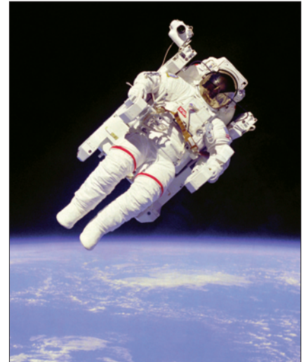
Astronauts using EVA jetpacks could visit NEOs and collect samples of regolith.

After rendezvous, astronaut field geologists will survey the object while stationkeeping. Initial remote sensing will pinpoint a few